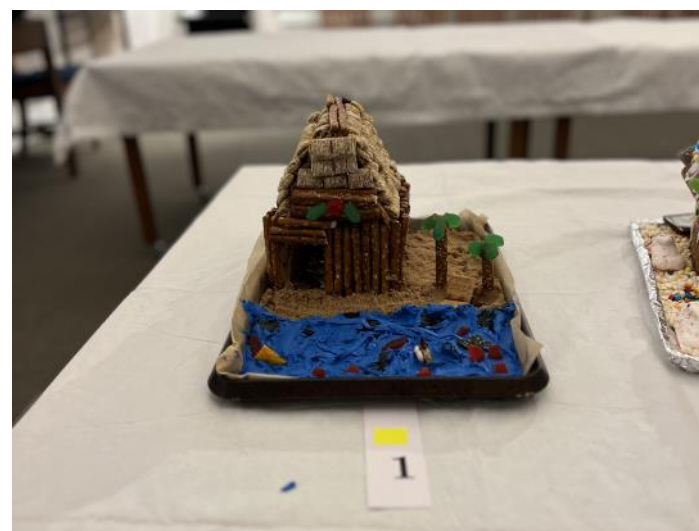
An entry from the 2022 Gingerbread House Contest.